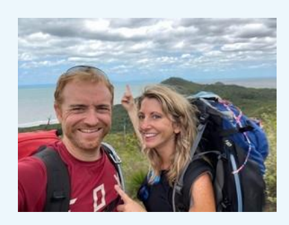
U.K. Family Doctor's Permanent Residency Application Denied Because Of English Test Mix-Up